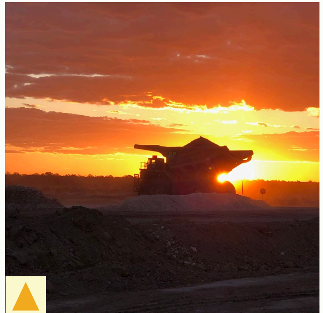
The Ultraclass model is customised to client specifications.