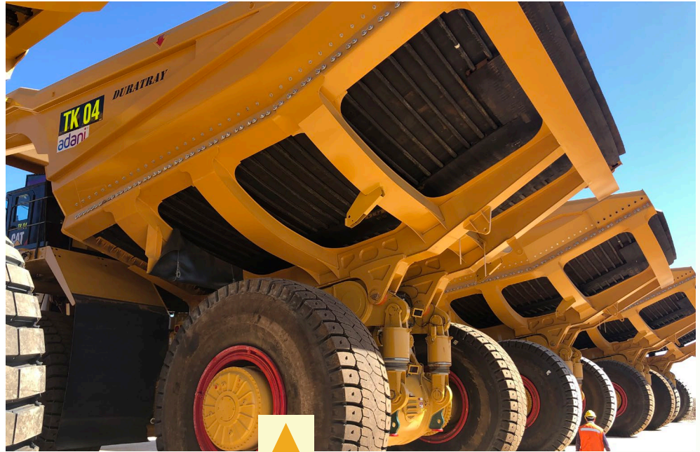
SDBs Ultraclass in North Queensland.

Like all Duratray Suspended Dump Bodies, this new Ultraclass model is uniquely customised to customer contract specifications for the mine site where it will be working. Corollary dump body designs for Caterpillar 796AC trucks have been produced for other potential clients in WA, NSW and Peru.