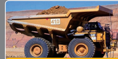
CAT 789 - Barrick Gold Cowal (Australia)