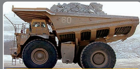
CAT 793 - BHP Ekati Diamond Mine (Canada)