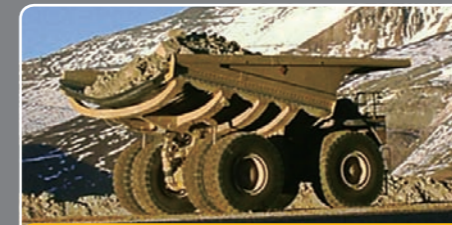
CAT 793 - Barrick Veladero (Argentina)