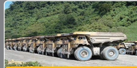
CAT 785 - Newcrest Lihir Gold Mine (PNG)