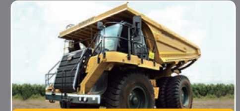
CAT 777F - Moolmans Contractors (South Africa)