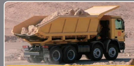
Mercedes Benz Actros 4144 - Transearch Co (Chile)