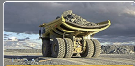
KOM 830 - Rio Tinto Diavik Diamond Mine (Canada)