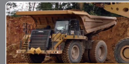
CAT 777F - Iamgold Rosebel (Suriname)