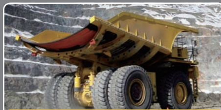
KOM 930E - Anglo American Los Bronces (Chile)