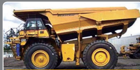
CAT 785 - BMA Norwich Park (Australia)