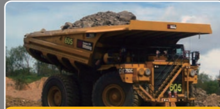
CAT 793 - Downer Goonyella Coal Mine (Australia)