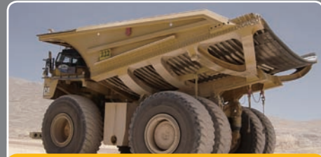
CAT 797B - BHPB Escondida (Chile)