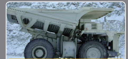
MT4400 - Taseko Gibraltar Mine (Canada)