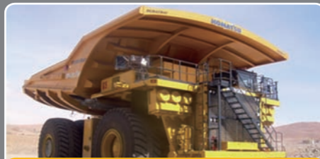
KOM 960E - Anglo-Xstrata JV Collahuasi (Chile)